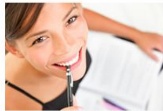
ONLINE FRENCH COURSES